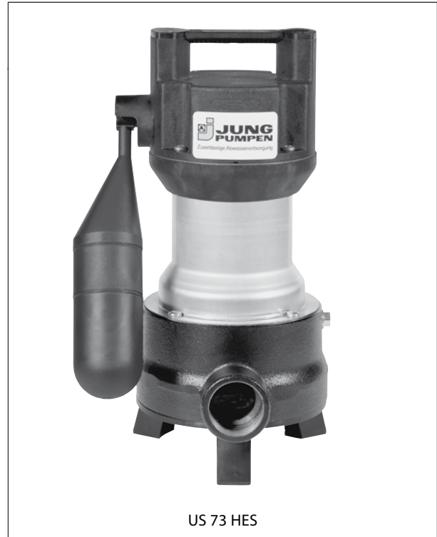
US 73 HES

The US 73 and 103 HE/HES must not be used for pumping sewage from lavatories and urinals.